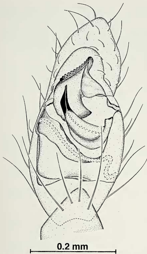
Figure 1.— Argyrodes fictilium from Nouveau-Québec Territories (49°48'N, 78°54'W) Québec, palpus, ventral view.

tario). Some new records presented here show a much more northerly distribution than previously reported. In particular, the records of Paquin and Dupérré (Table 1) in the black spruce forest of eastern Canada and the one by Aitchison-Benell & Dondale (1992) in Manitoba extend the species' distribution to the boreal region.